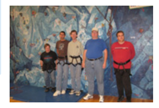
Members of CSCL on a rock climbing trip.

I am motivated by the folks we support, the wonderful staff at our agency and our Board of Directors who are extremely supportive and a valuable resource. We practice person-centred programming and planning. Everything we do is centred around who we serve and support. There is no slack time and time passes ever so quickly. The work that we do is challenging and rewarding.