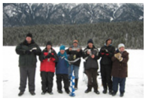
Activities also included an ice fishing excursion.

of work performed. Having said this however, academic ability complements success on the jobs. We do need staff that have some training to complement their emotional intelligence.